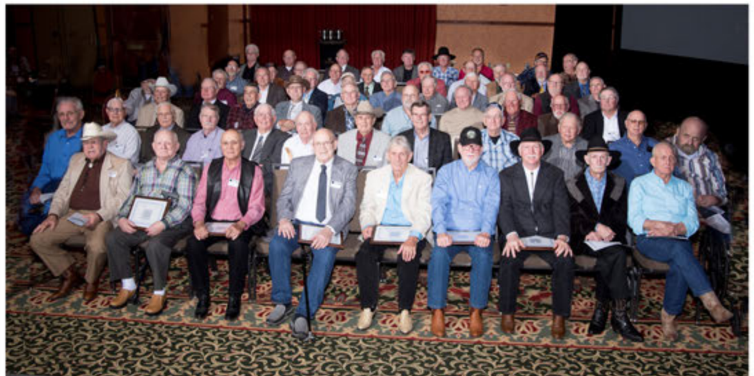
Thursday evening, we honored our retired members with 50+ years of service. "What a remarkable group of men who brought this Local together 69 years ago and have entrusted it into our hands for safe keeping."