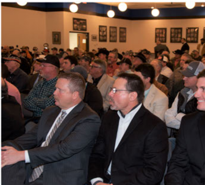
January 2018 Membership Meeting