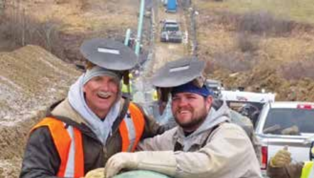
Welded Smithfield, OH