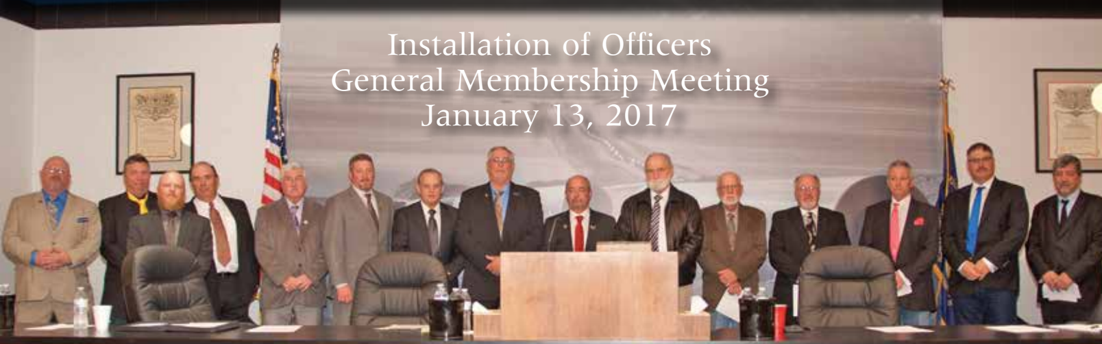
Installation of Officers General Membership Meeting January 13, 2017