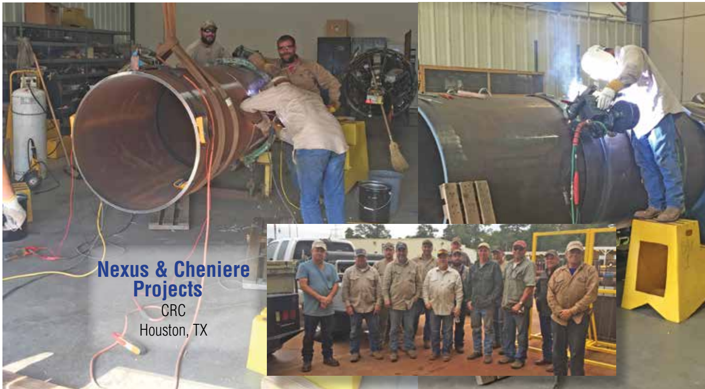
Nexus & Cheniere Projects CRC Houston, TX

Brothers and Sisters, I am writing this report from West Texas while checking on non-union jobs. The work out here is still slow, but a few smaller jobs are going on. It seems the drilling is starting to pick up in this area so that's always a good sign for us. As usual, when the work slows the non-union waste no time slashing wages and good conditions are nonexistent. Many are working for contract wages with no overtime, furnishing consumables or liability insurance.