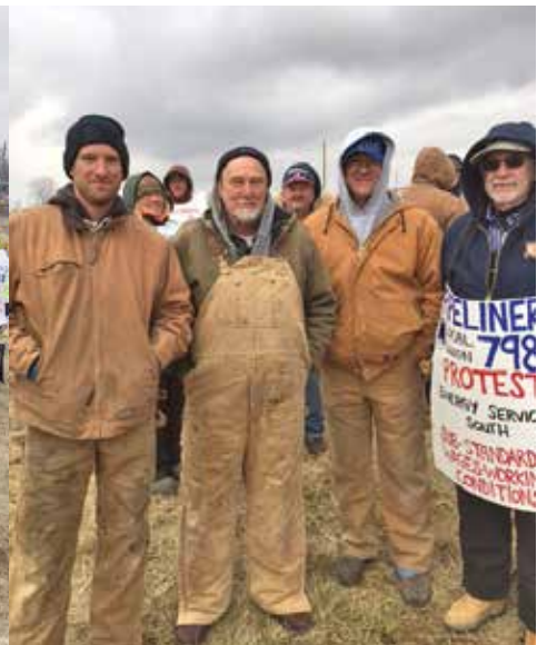
Kenton, OH Picket February 2017